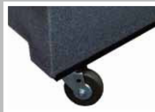
4" Heavy-duty Casters