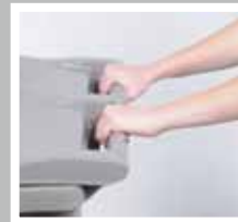
Durable and strong handles