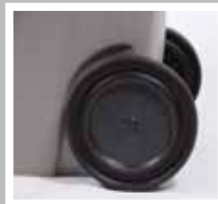
12" rubber wheels