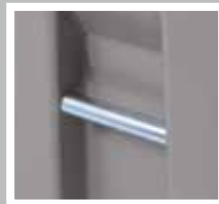
Metal lift bar