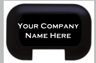
Hasp lock adaptor can be custom stamped