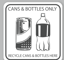
Labels available in any language