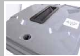
Hard drive label and paper slot on E-S240L cart creates hard drive cart