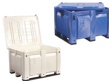
MACX® Custom Lids