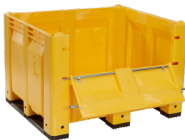
MACX® Removable Door