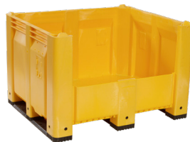
MACX® Cut Out Wall