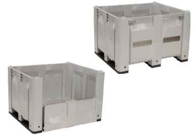
MACX® Drop Door